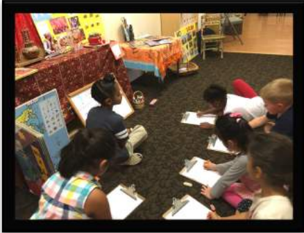
Keerat is giving a lesson to the Redwood Classroom on the Punjabi Alphabet.

As part of Montessori's multiage classroom, we encourage leaderships. It is typical to see older children teach and model for the younger students. It gives the older children the opportunity to grow deeper in their thinking, to develop leadership skills and to build confidence.